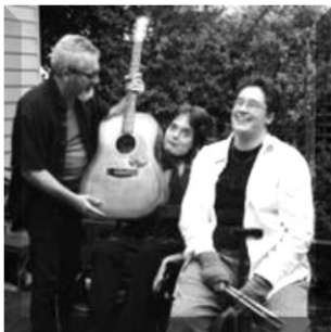
Bearbrass Asylum Orchestra

Crip-folk trio the Bearbrass Asylum Orchestra are the rebels of Australia's disability music scene. They originally formed as the backing band for an amputee strip-tease artist and are the house band for Quippings, the only regular queer/disabled cabaret night in the country. Their performances are aimed at proving that people with disabilities are just as capable of promiscuity, drug abuse and debauchery as anyone else. Their debut film clip, Welcome won the judge's choice award at the Nova Focus on Ability Short Film Competition and will be featured in the Other Film Festival in Melbourne in December.